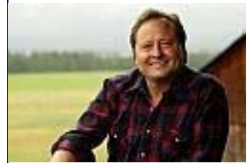
Governor Brian Schweitzer